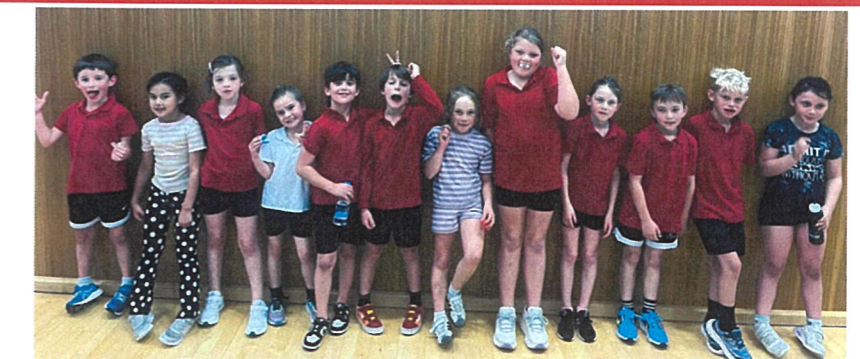
Cobden School Basketball teams: Year 7 & 8 Team - the Cobden Crushers. Year 3 & 4 Miniball - Cobden Cougars & Cobden Cyclones. The Year 5 & 6 Cobden Cobras start in Term 3.