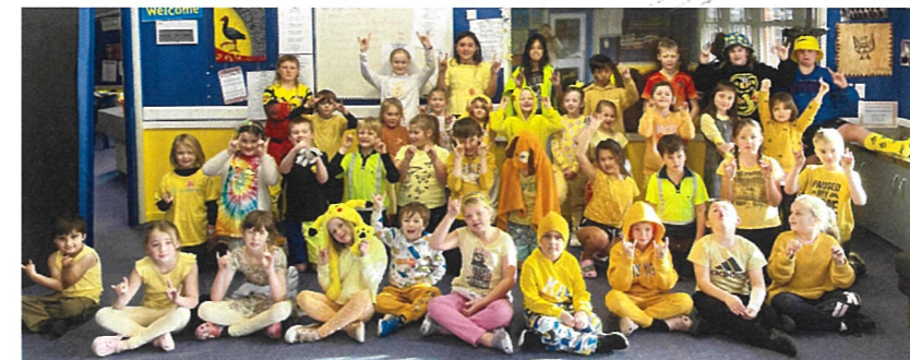
Wear Yellow for Harold Mufti Day - We raised $152.50 for Harold and the Life Education Truck. Thank you for your support!